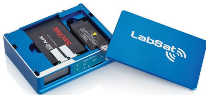
LabSat 3 Wideband - Greatly increases GNSS Record and Replay capabilities

LabSat 3 Wideband is housed in a conveniently small enclosure measuring 167mm x 128mm x 46mm and weighing only 1.2kg, so it can be used to record GNSS signals anywhere. Subsequent replay is entirely realistic to allow for robust product development and testing.